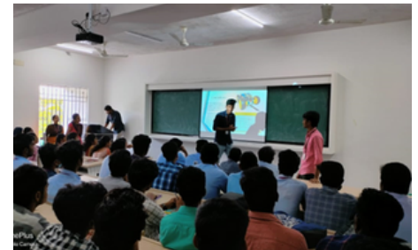
Interaction between the members and students