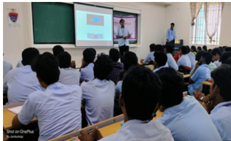
Members explaining about Gameplay