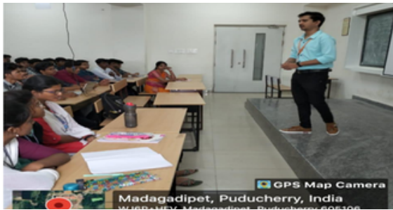
lecture on Java Programming