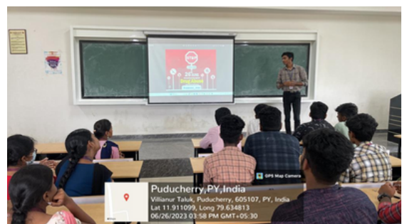
On June 26, 2023, III year ECE students spoke on the dangers of drug use and prevention for Drug Abuse Day.