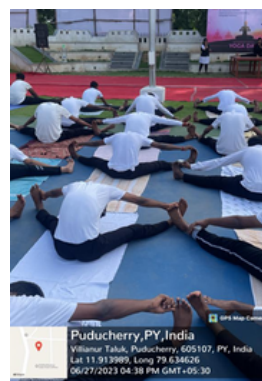
On June 27, 2023, ECE students won first prize in competitions celebrating National Yoga Day.