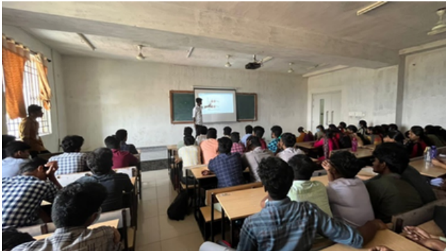
Members delivering about the Bot Components

In the "Modern Designing of Bot" activity, participants dive into the exciting realm of chatbot development, where they learn to create intelligent systems that can interact naturally with users. This hands-on experience combines cutting-edge technologies like AI, natural language processing, and design thinking, empowering teams to craft bots that are both effective and user-friendly. By focusing on real-world applications, attendees will explore various scenarios, from customer service to personal assistance, while honing their skills in designing conversational flows and ensuring an engaging user experience.