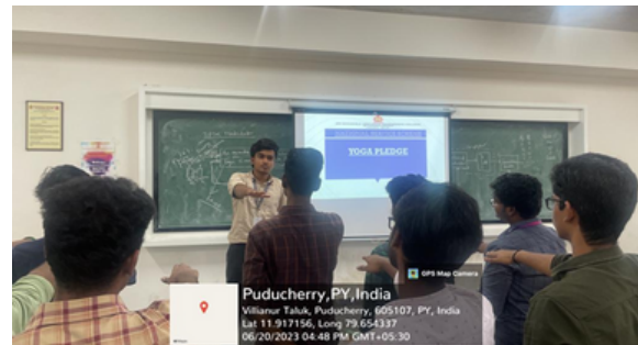
On June 20, 2023, 75 students from III – ECE – B section took a yoga pledge for a healthy, stress-free life.