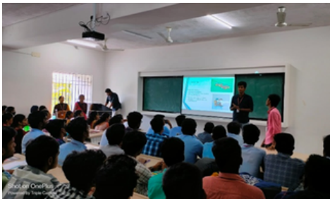
Members explaining about Construction

In the "Modern Designing of Bot" activity, participants dive into the exciting realm of chatbot development, where they learn to create intelligent systems that can interact naturally with users. This hands-on experience combines cutting-edge technologies like AI, natural language processing, and design thinking, empowering teams to craft bots that are both effective and user-friendly. By focusing on real-world applications, attendees will explore various scenarios, from customer service to personal assistance, while honing their skills in designing conversational flows and ensuring an engaging user experience.