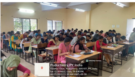
On June 21, 2023, ECE students participated in an essay writing competition during the college's Yoga Day events.