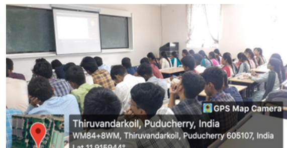
Students Listening for Basics of Communication Protocols