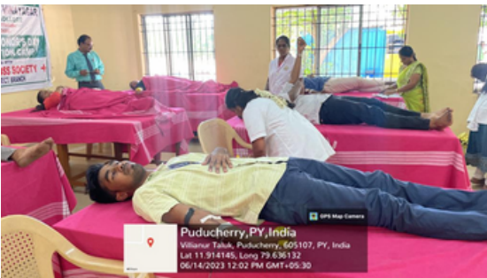
On June 14, 2023, department volunteers donated blood to Government Hospital, Mundipakam.