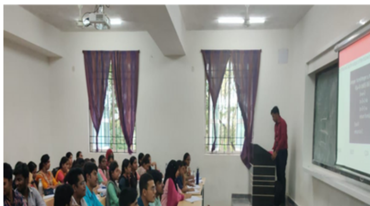
Session on Hands on Training Conducted by CTS