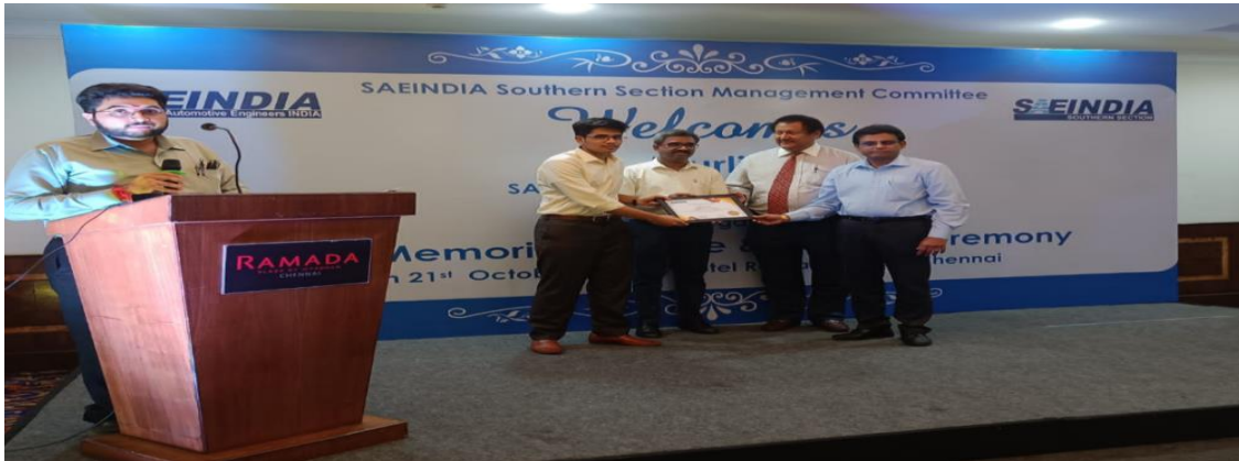
Student Received BEST STUDENT AWARD from SAEINDIA on 21-10-2023

Handwritten signature of the Staff Incharge.