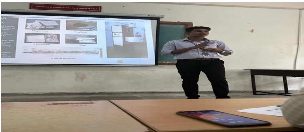
TIER-1 student Programme (SAEINDIA COMPETITION) conducted on 29-04-2023