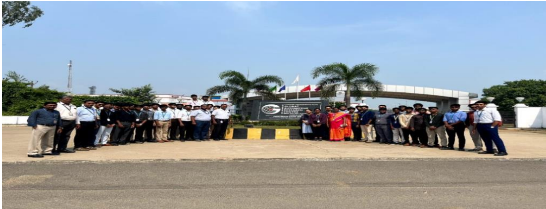
Students visited Global Automotive Research centre (GARC), Chennai on 22-10-2023