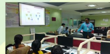
Cloud computing -Networking session for final year students