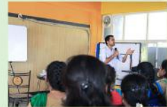
CoreEL Technologies Bangalore