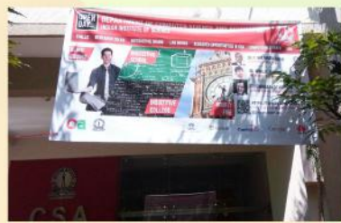
IISc Bangalore Open Day