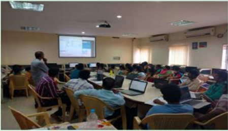
Software testing and tools for third year students